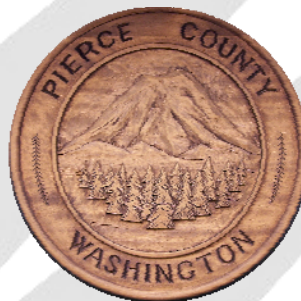
The official seal of Pierce County

...and introduced 144 ordinances and 157 resolutions