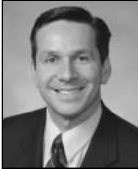
Dino Rossi Republican

15100 SE 38th St #715 Bellevue, WA 98006 (425) 646-7202