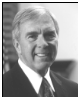
George R. Nethercutt, Jr. Republican 330 112th Ave NE Ste 101 Bellevue, WA 98004 (425) 462-6152

Education: Nethercutt graduated from North Central High School and earned a B.A. in English from Washington State University in 1967 before graduating from Gonzaga University School of Law in 1971, and was admitted to the Washington State Bar Association in March 1972.