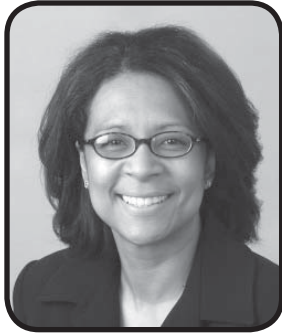
Marilyn Strickland PO Box 1337 Tacoma, WA 98401 (253) 468-2518