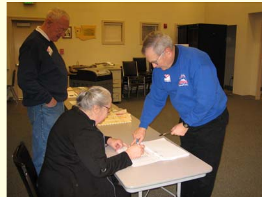
A polling place on General Election Day in 2005