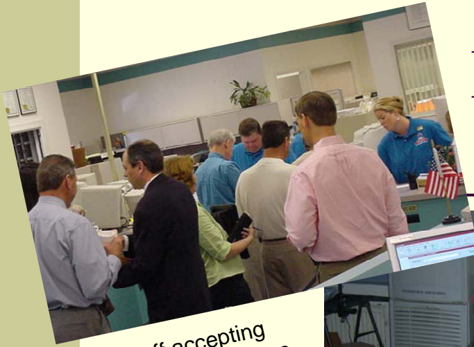
Election Staff accepting candidate filing declarations