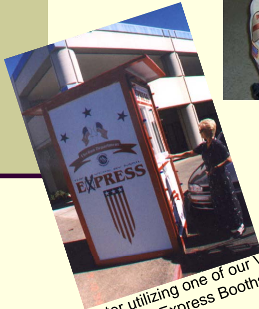
A voter utilizing one of our Vote by Mail Express Booths