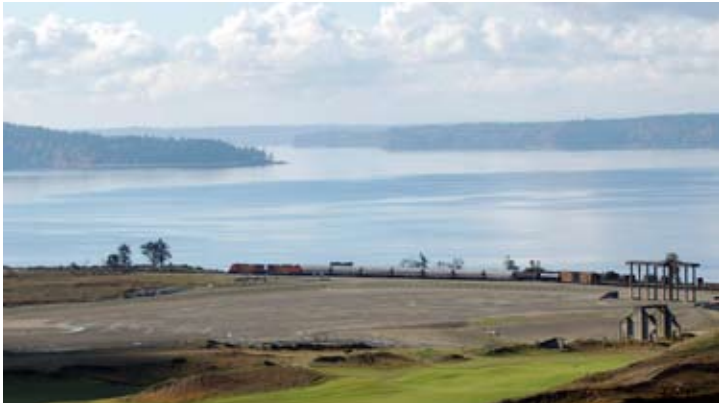
A BNSF train rolls past Central Meadow