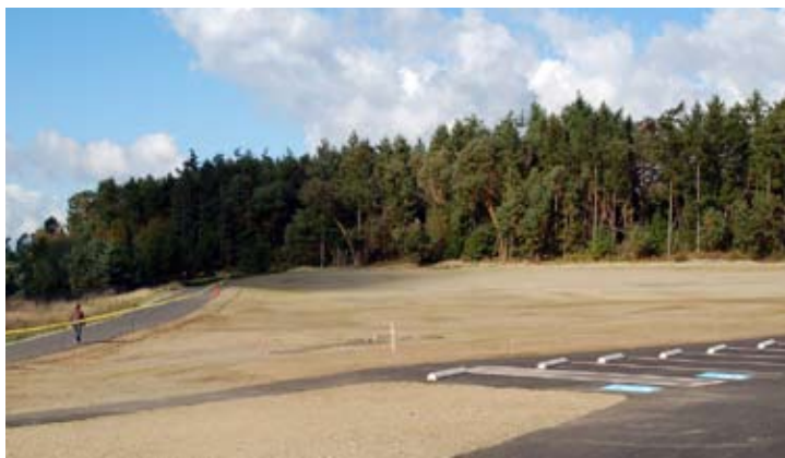
Looking northwest across North Meadow

The preservation of existing mining relics links the historic use of the site to the present. The “swing set” is a large concrete structure that is located at the west end of the event lawn. Remnants of seven sorting bins and a conveyor tunnel at the north end of the meadow serve as a buffer to the Chambers Bay golf course. Central Meadow also features a half-mile loop trail that links to Soundview Trail and will eventually provide access to the North Beach and North Dock via an overpass. Native grasses will be planted throughout in combination with hundreds of native shore pines and other trees. A new restroom facility at Central Meadow and a parking area with space for 84 cars will be opening early 2008. This will open vehicular access to the lower portions of the Soundview Trail, making it more accessible to all.