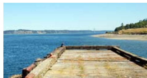
Looking north from North Dock

We are very excited to participate in this process. The valuable information that comes out of it will be used to create environmental education experiences to match the unbounded potential of the Chambers Creek Properties. As this process begins to unfold over the coming months, we expect to learn much about the Chambers Creek Properties and the large community it serves.