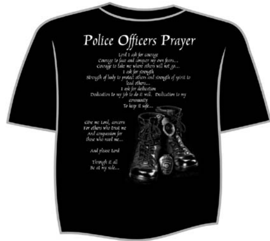
Shirt Back (Med-3XL)