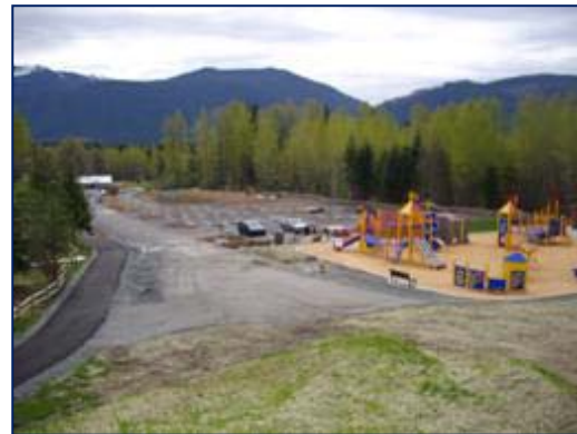
Ashford Park – August, 2011