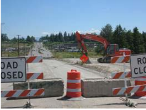
176th looking East to Canyon Road