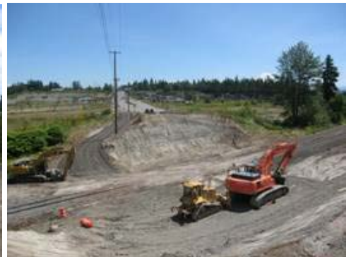
From the top looking down