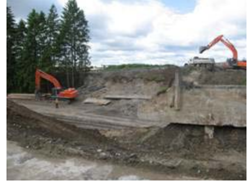
Bridge removed – looking east

These photos above and below were taken in late July as work continues on the replacement of the over-cross Tacoma Rail Bridge at 176 th Street and 52 nd Avenue East. Upgrades to the roadway approaches to the bridge at 52 nd Avenue East are also part of the project. By doubling the lanes available, real congestion relief will occur on all of 176 th Street.