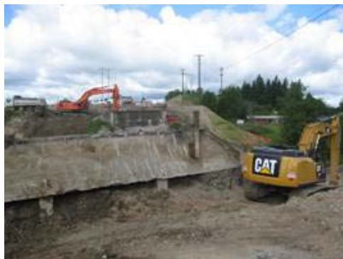
Bridge removed – looking west