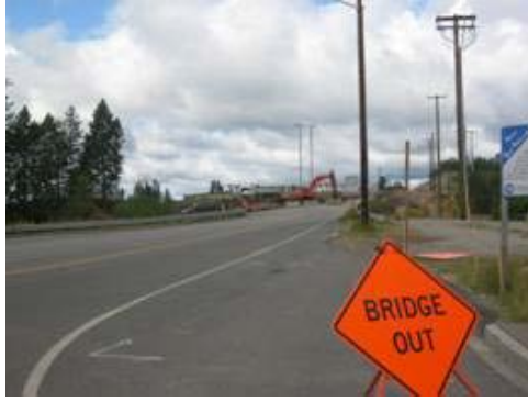
Looking west on 176th Street