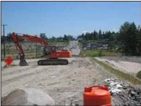
From the top looking east

Traffic Impacts: Traffic is being detoured on 176 th Street between Canyon Road and 38 th Avenue until project completion in November.