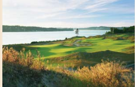
Chambers Bay Golf Course

We have 22 cities and towns in Pierce County, each with unique offerings. For example, Tacoma rightly boasts of its museums, convention center, theaters, and waterfront parks. Puyallup is home to one of the nation's ten largest state fairs and Gig Harbor's maritime heritage is evident throughout this thriving community.