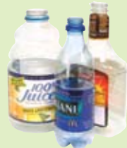
Plastic bottles (necks smaller than base)