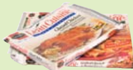
Paper or frozen food boxes

No DO NOT put these items in your recycling cart.