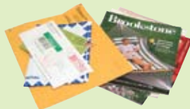
Mail, magazines, mixed paper and catalogs