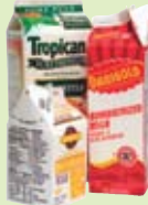
Paper milk-style cartons