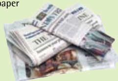
Newspaper & inserts