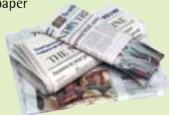
Newspaper & inserts