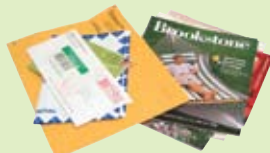
Mail, magazines, mixed paper and catalogs