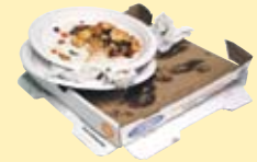
Food-contaminated paper plates and napkins