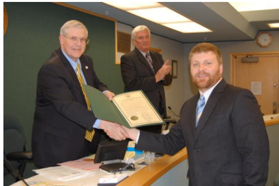
2010 "Sustainability Week" Proclamation No. R2010-47

Sustainability isn't just a buzz word – it's a team effort to make our government more fiscally and environmentally responsible. From adopting sustainable budgets to increasing the energy efficiency of government buildings, Pierce County embraces sustainability and is always looking for further ways to make positive changes.