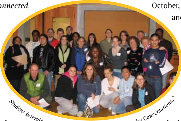
Student interviewers and mentors participate in "Earthy Conversations."

Our goal is to gain a unique understanding of our community and its environmental aspirations. As more and more interviews are completed, common themes will begin to emerge and the individual interviews will begin to form a larger picture. In