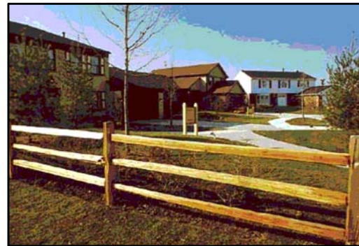
3 Rail Cedar Fence Example