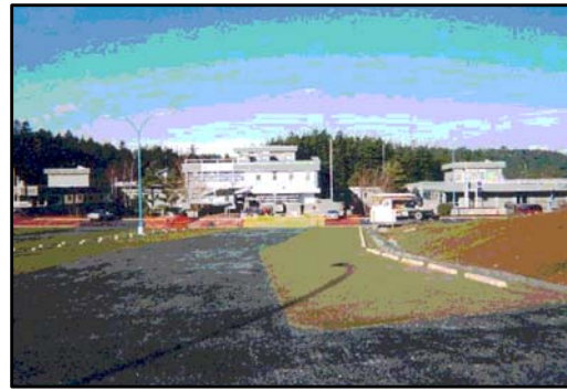
GrassPave2 W/ Porous Asphalt Parking Example