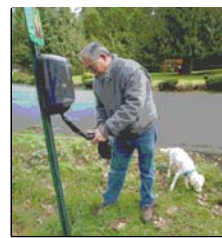
Dog Waste Station Example