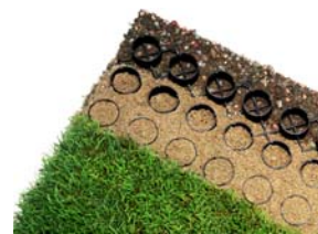
GrassPave2 Detail Example