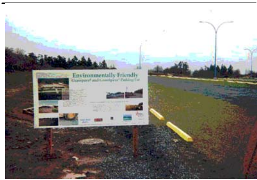
Project Sign Example