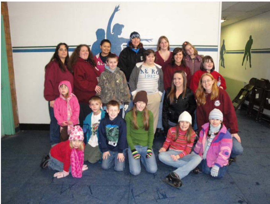
Ice Skating at Sprinker Recreation Center on December 21, 2010. It was a great day for skating, and a great way to kick off Winter Break!